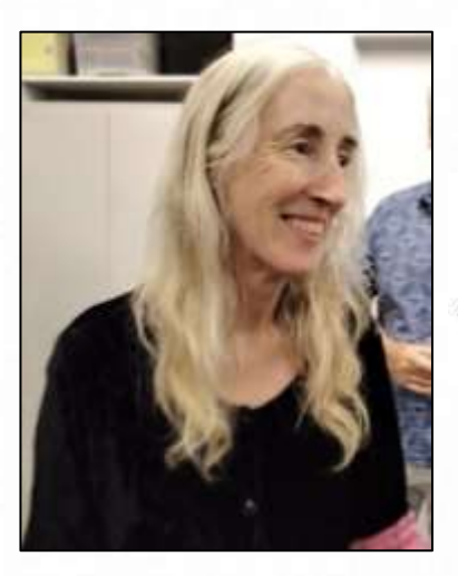
Thanks a Million.